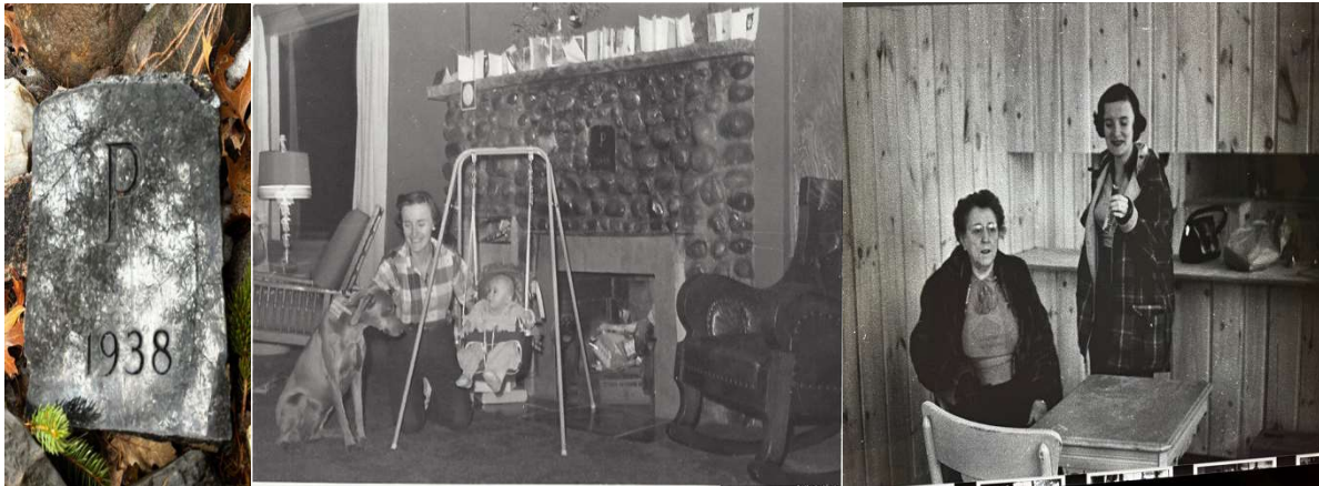
The corner stone above was when field stone fire place was built in the living room. Below is a pic of the outside view of the chimney.